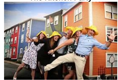
A Down home Newfoundland Evening